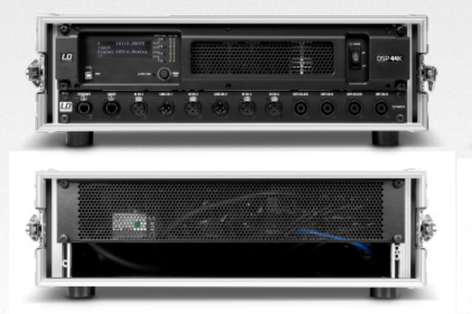
DSP 44 K RACK PROFESSIONAL DSP POWER AMPLIFIER WITH DANTETM INTERFACE

For optimal speaker performance and safe operation the DSP power amps are equipped with an LD Systems® loudspeaker preset library, and the included software enables computer control and monitoring.