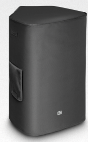
STINGER 15 G3 PC LDEB152G3PC PROTECTIVE COVER FOR STINGER 15"