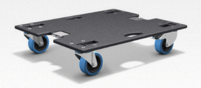
STINGER SUB 18 G3 CB LDESUB18G3CB CASTOR BOARD FOR STINGER SUB 18"