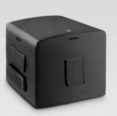
STINGER SUB 15 G3 PC LDESUB15G3PC PROTECTIVE COVER FOR STINGER SUB 15"