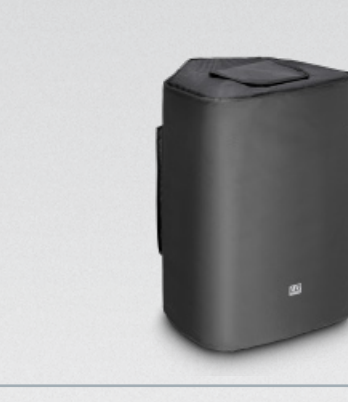
STINGER 10 G3 PC LDEB102G3PC PROTECTIVE COVER FOR STINGER 10"