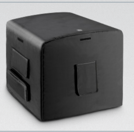
STINGER SUB 18 G3 PC LDESUB18G3PC PROTECTIVE COVER FOR STINGER SUB 18"