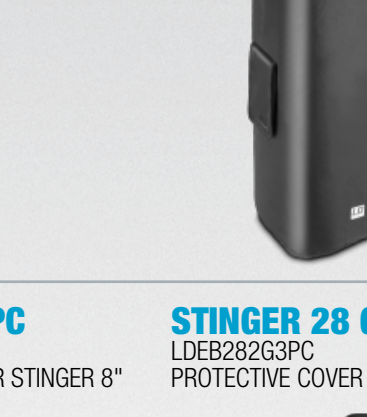
STINGER 28 G3 PC LDEB282G3PC PROTECTIVE COVER FOR STINGER 2 x 8"