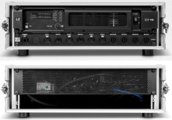
DSP 45 K RACK PROFESSIONAL DSP POWER AMPLIFIER