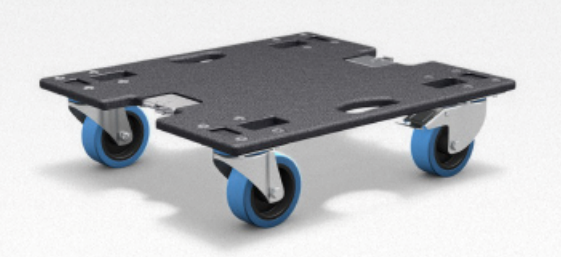
STINGER SUB 15 G3 CB LDESUB15G3CB CASTOR BOARD FOR STINGER SUB 15"