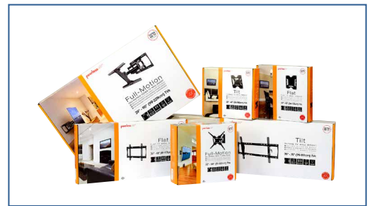
Comes in color packaging with included installation hardware and easy to follow instructions.