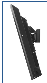
15°/-5° of tilt for versatile viewing angles.

Please visit peerless-av.com/en-us/patents for patent information.